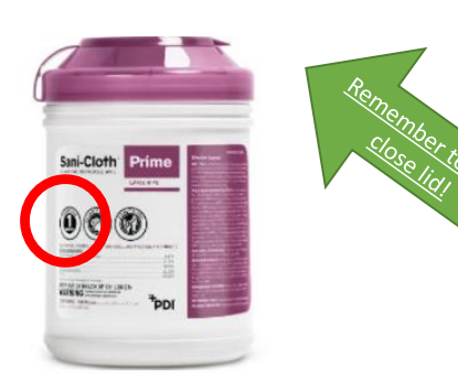
1 MINUTE WET contact time